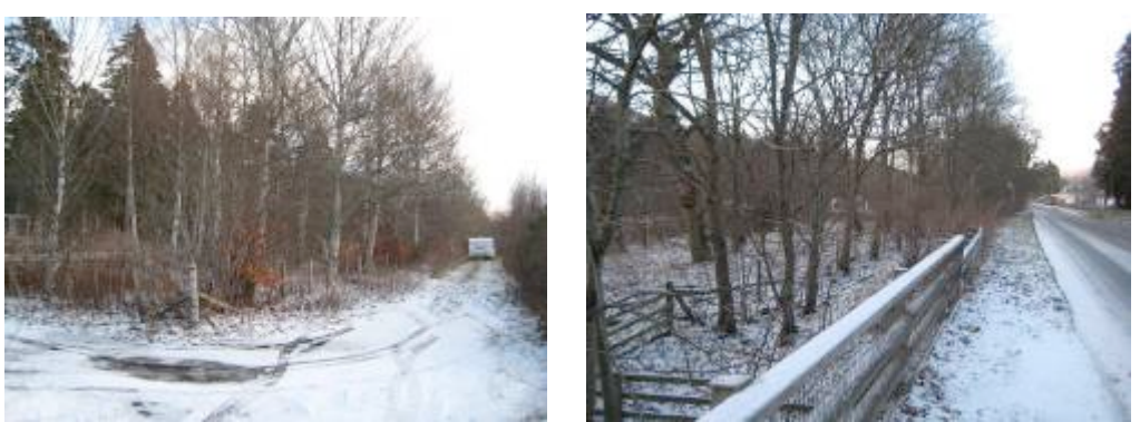
Fig. 2 & 3 - View looking into site from east to west respectively

1. The application site is located 150m west of the entrance to Blair Atholl, immediately to the south of the B8079 road and the Industrial Estate. It comprises 2.6 hectares of overgrown scrubland interspersed with trees adjacent to the Perth railway line. The adjacent area is heavily wooded forming a general backdrop to the site; the River Garry is further southwards. An informal track/pathway runs through the site parallel with the railway line, where an abandoned caravan is also prominent (enforcement investigation is currently underway).