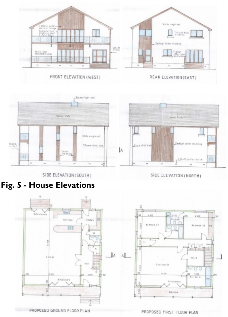
Fig. 6- Floorplans